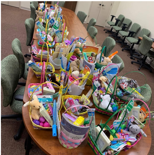
26 Easter baskets for families served by St Francis House.