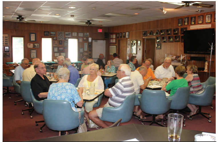
A good crowd enjoying the food